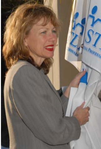
A flag bearer preparing to march across the Memory Field